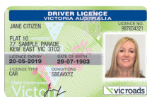
Australian driver licence