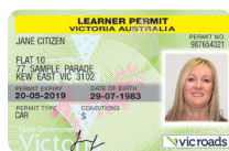
Victorian learner permit