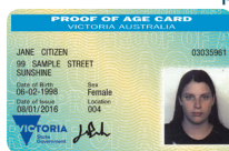
Proof of age card