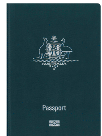
Australian or foreign passport