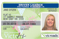
Australian driver licence