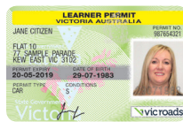
Victorian learner permit