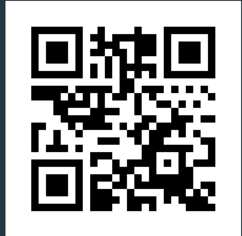
Residents Contact List Sign-Up Please scan and complete form